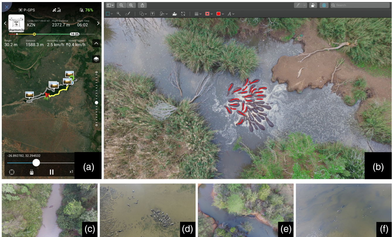
FIGURE 2 A selection of imagery representing the UAV census process (a) a sample flight path of a UAV census of Nyamiti Pan in August 2016 (b) a screenshot of a UAV image taken at Dephini showing the interface used to count hippos (c-f) a selection of photographs from the UAV census conducted in August 2016 exemplifying differences in ease of detection of hippos at four different survey locations (c) a single hippo at Bhakabhaka (d) a large congregation of hippo's in muddy water at Banzi (e) a small pod well-hidden at Shabathan (f) a set of hippos basking in shallow water on the periphery of Nyamiti Pan

the level of submergence, and level of disturbance of hippos. Increased numbers of images were taken of large congregations, pods that were either entirely or partially submerged, and groups that were disturbed by the presence of the UAV. An effort was made to capture as many hippos in each photograph as possible. If congregations of pods did not allow for all hippos to be captured in a single photograph, sets of photographs were taken of different portions of hippo congregations so that all individuals could be accounted for. It was necessary that UAV batteries be fully charged before each survey. Therefore, batteries were charged in a research vehicle between survey locations using a car-charging adapter.